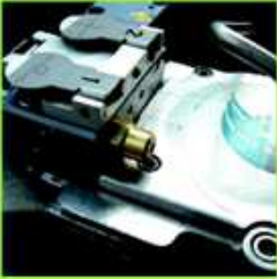
New cooling welding time indicator