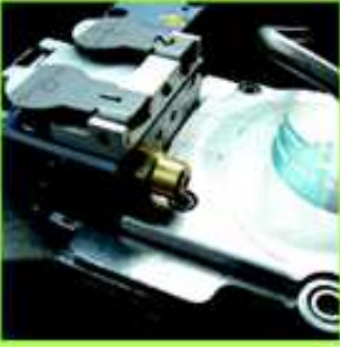
New cooling welding time indicator